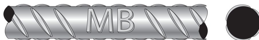
Mesh & Bar Marking